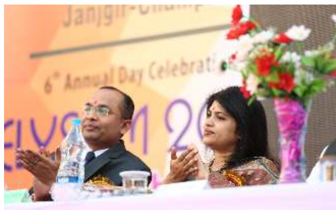
Smt Niharika Barik Singh (IAS) Commissioner, Bilaspur Zone (2016-17)