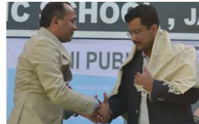
Mr. Sonmani Borah Commissioner Bilaspur Zone (2015-16)