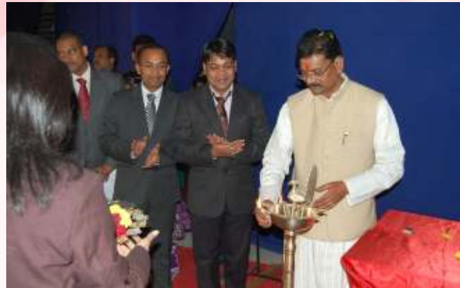
Dr. Charan Das Mahant Union Minister of State for Agriculture and Food (2012-13)