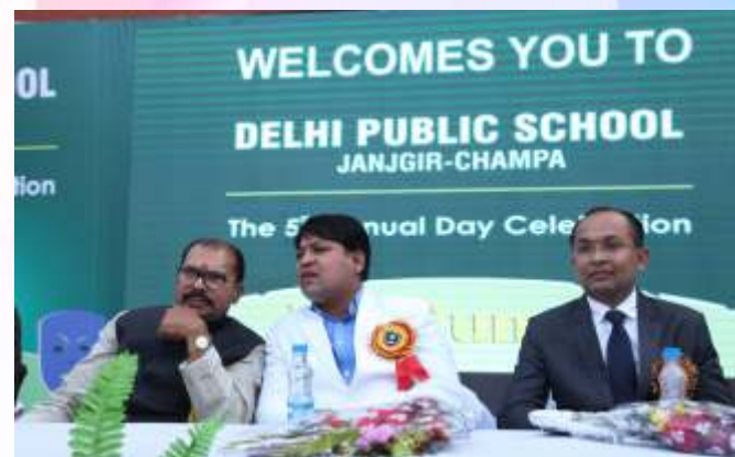
Shri Motilal Dewangan MLA Janjgir-Champa (2015-16)