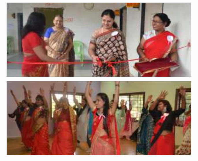
JOY OF GIVING WEEK 12<sup>th</sup> January, 2020 to 17<sup>th</sup> January 2020

Joy has also many forms. Sometimes we get joy by achieving something, sometimes by receiving something. But the most divine form of joy is the one which we get when we give something to someone. The feeling doubles when you become reason of someone's joy.