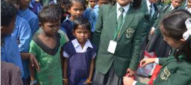
PARENT'S DAY 18<sup>th</sup> January, 2020

Parents are the real treasure of our life. They give us birth like Brahma, Nurture us like Vishnu and Protect us like Lord Shiva. DPS-JC Celebrated Parents' Day on 18.01.2020 to make the young minds sensitize about the Love, Care and Affection of Parents in their lives. All the Parents of Pre-Nursery to KG-II from DPS-KIDS and Nursery to Class I from DPS-JC were invited in the school premises with their children at 04:00 PM.