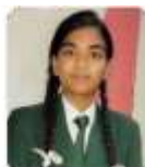
MILKY KHUNTE 95%